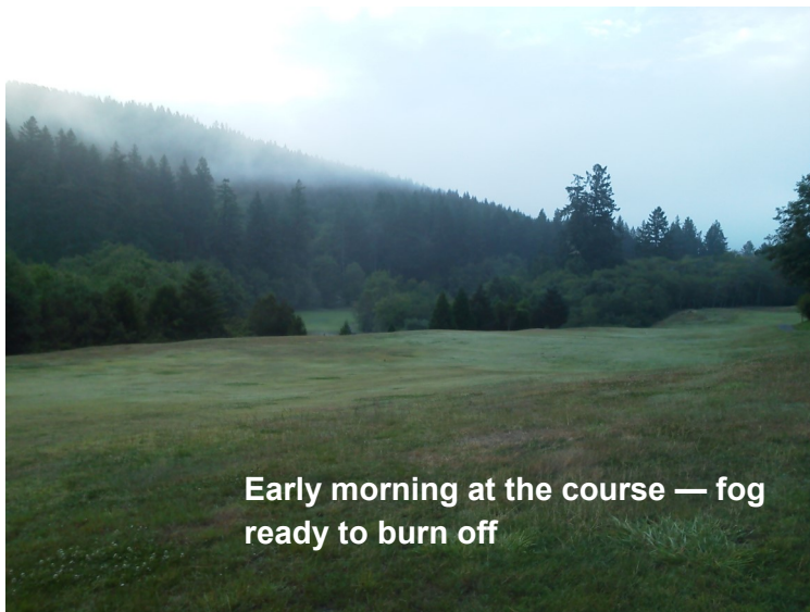
Early morning at the course — fog ready to burn off

The City of Brookings has been a great supporter for Salmon Run and has started the process of putting together a promotional clip for the course. This will be filmed toward the end of August (with lots of green grass) and will include drone footage of each hole. In addition, we'll be looking for a few golfers to talk about what they love at Salmon Run. This will be posted to the City website as well as our website and social media.