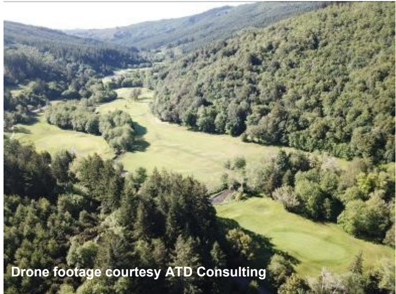
Drone footage courtesy ATD Consulting