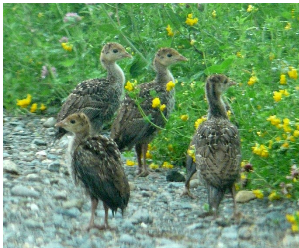
Baby turkeys on #10/11/12 rough