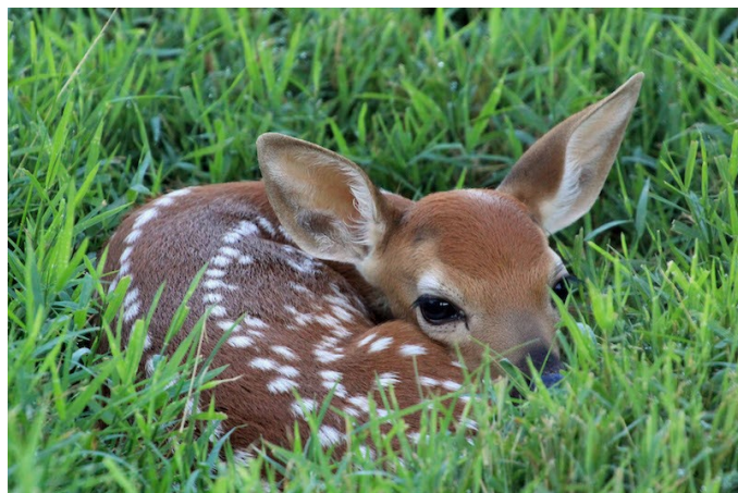
Fawn hidden in "rough" - Mom will be back!