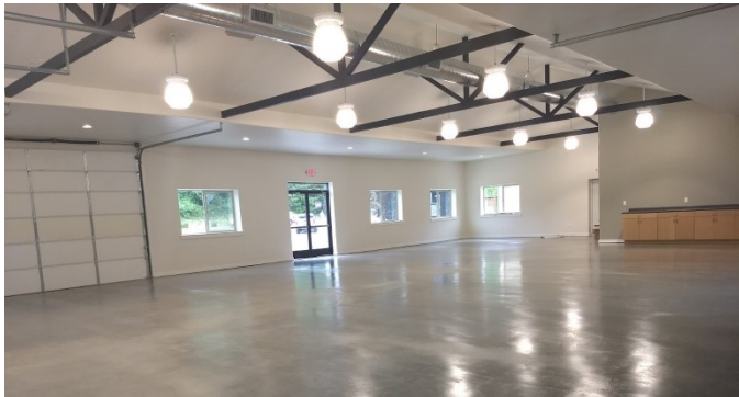
Occasion Hall inside finished with catering counter, polished floors

Keep track of us on Instagram & Facebook for more specials.